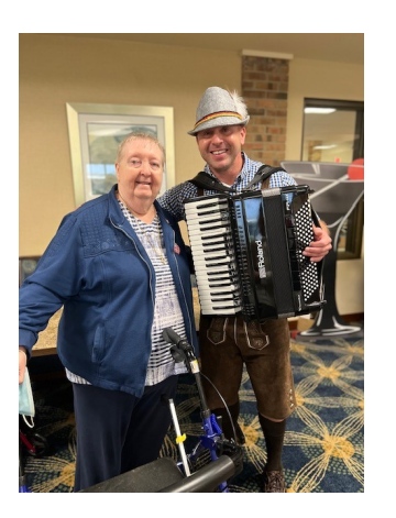
Birthday Dinner Oktober Fest