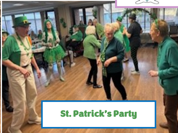
St. Patrick's Party