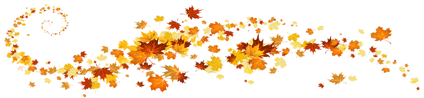
Autumn is finally here!

Bring out the spiced cider and cinnamon donuts!!