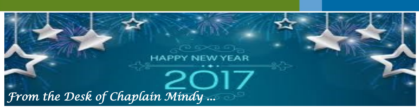
And now we welcome the New Year, full of things that have never been!

Just stop and think about that statement for a minute. It's a new year! The old has passed and a new slate is before us - Oh the possibilities!